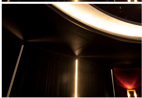
A motorised lift hides the projector in the ceiling when not in use.