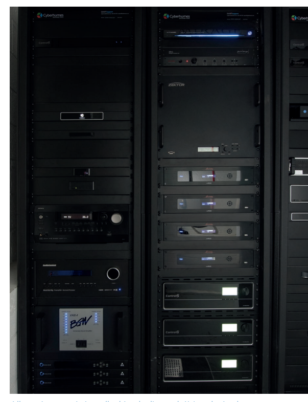
All equipment is installed in dedicated AV racks in the plant room, minimising the technology's impact on the home's interior design

treatment already lie behind pleated, stretched-fabric walls.