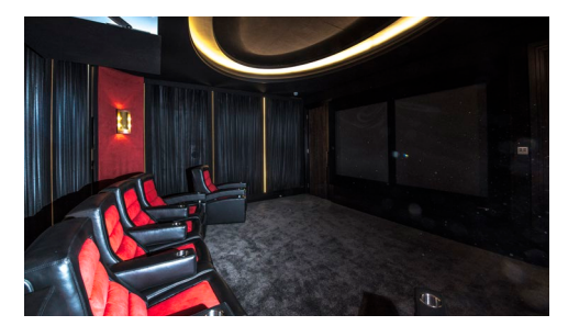
Full closure masking protects the screen when not in use.

We also had the room acoustically treated, which involved installing absorption and bass management panels. The coffered ceiling minimises sound reflection, and adds a touch of elegance with its starfield lighting effect.