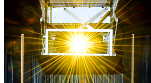
Sony 4K projector is bright enough for the most demanding of movies.

A second such connection allows a games console to be plugged into the cinema room and fed back to the video matrix. The result is large-screen gaming with full 4K resolution, high-frame rate support, and Dolby Atmos surround sound—an ultimate gaming experience, which the couple's children love sharing with their friends.